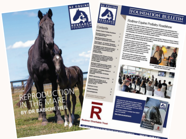
The Foundation Bulletin has also been released.